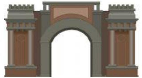
New Gate International Church